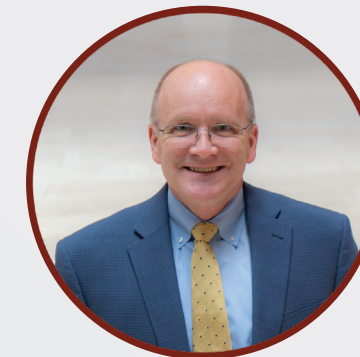
SOUTH-EAST USA