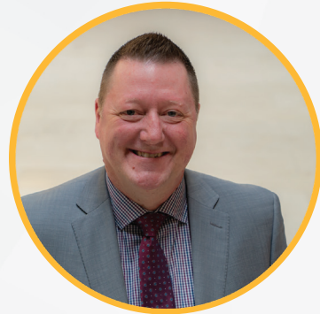
NORTH-WEST USA