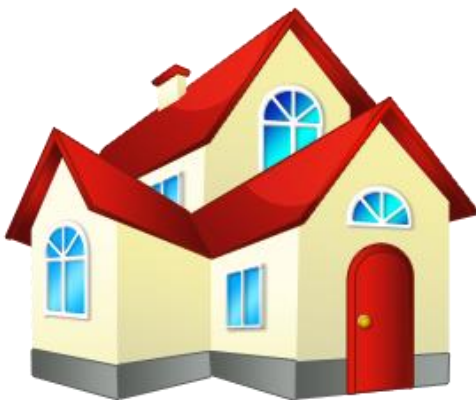
#10 - Passover