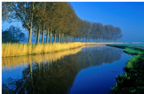
#1 Water to Blood (Color the water red)