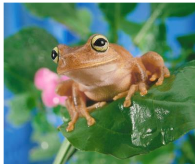
#2 - Frogs