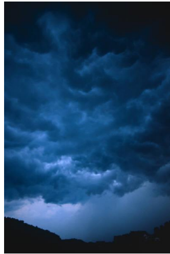
#7 – Hail Storm