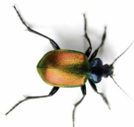
#3 – Lice