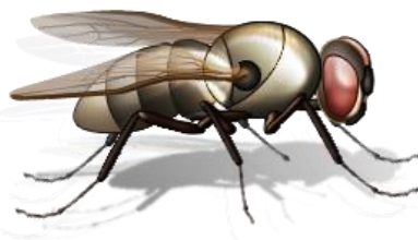
#4 - Flies