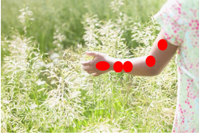
#6 – Boils