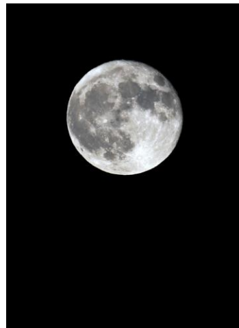
#9 - Darkness